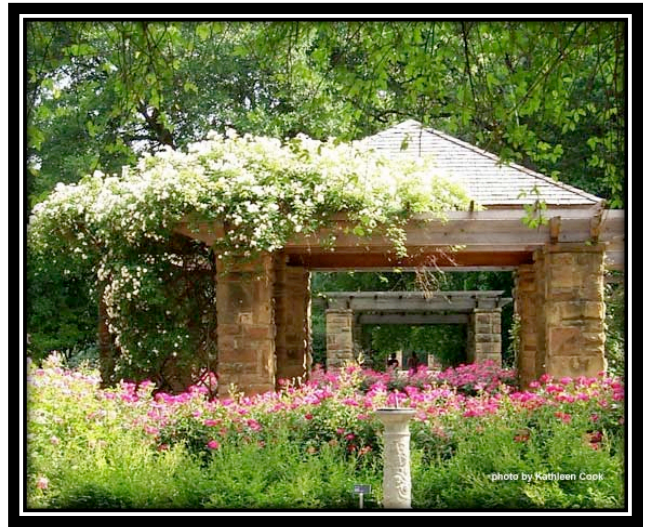
Oval Rose Garden

[Each rose name is followed by the classification abbreviation, color, date of